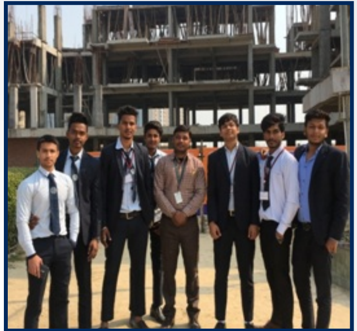
Industrial Visit to KLASSIC HOMZ (Civil Engineering Student)