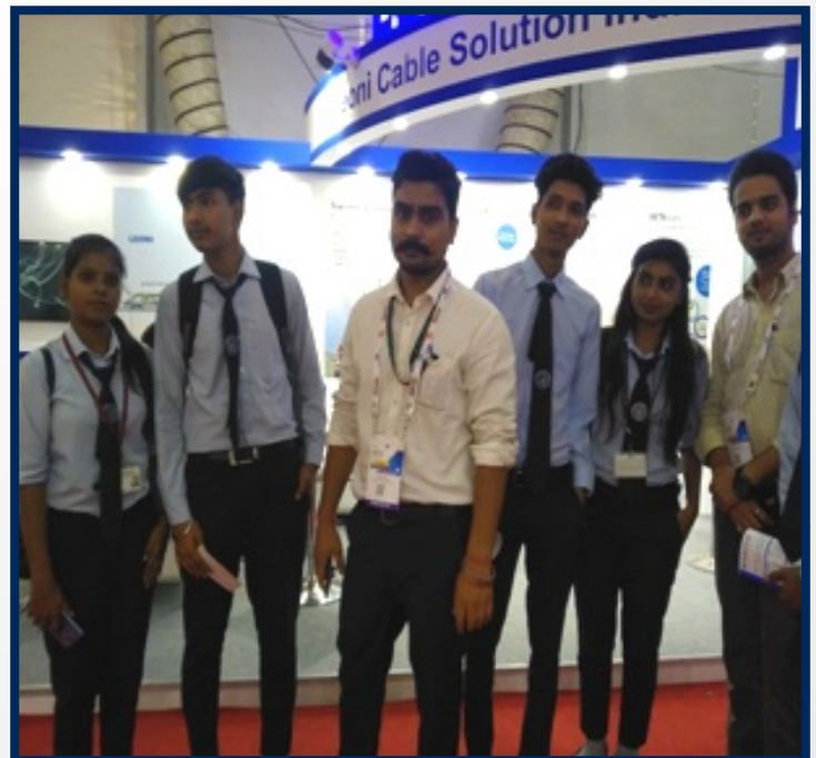
Industrial Visit to International Railway Equipments Exhibition