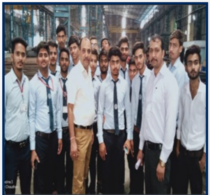
Industrial Visit to Gaurang Pvt. Ltd. (ME- Students)