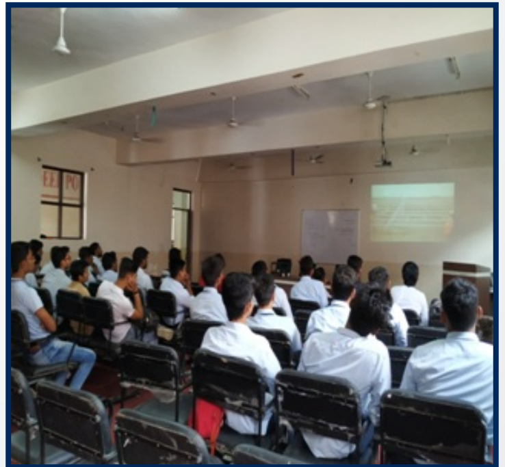
Seminar on Latest Technology in Mechanical Engineering (Solar Energy)