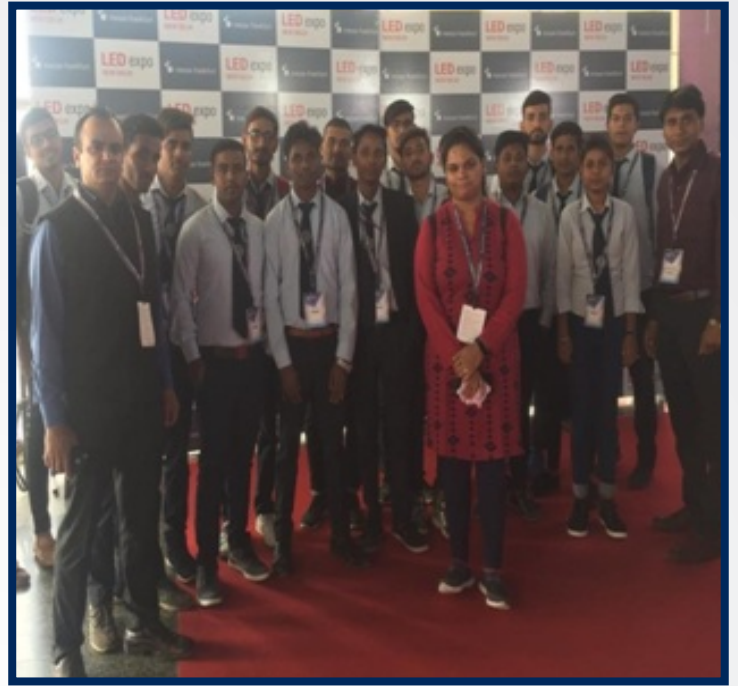
Industrial Visit to LED Expo