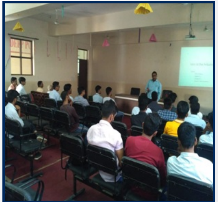
Workshop on "Introduction to Arduinio"