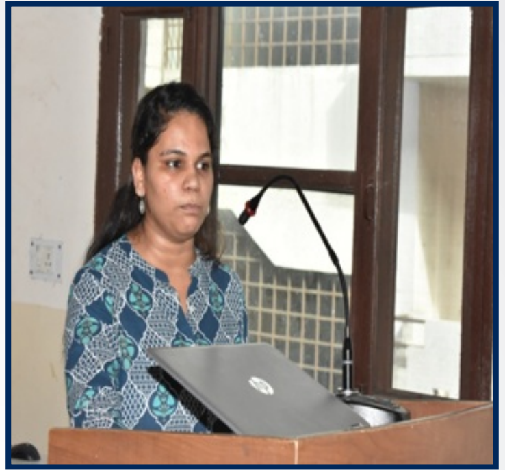
Workshop on "Introduction to EMBEDDED SYSTEMS"