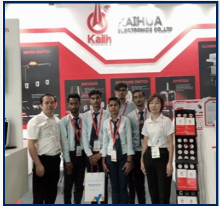
Industrial Visit to Smart Cards Expo (Electronics Engineering Students)